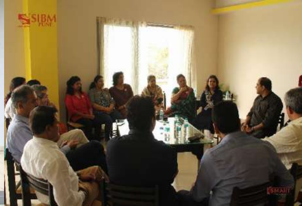
PHOTO SHOOT FOR THE BATCH OF 2017

The graduating batch of 2017 was invited for an informal photo shoot. The photos clicked during the event were used for the Yearbook (an annual publication of the Alumni Team). Pictures were clicked according to the different specializations, council teams (I Tenure, J Tenure and S Tenure), special interest groups (SIGs) and also entire batch pictures were taken. Pictures of the administrative staff and the faculty were also clicked. This event is a favourite among the students of the graduating batch.